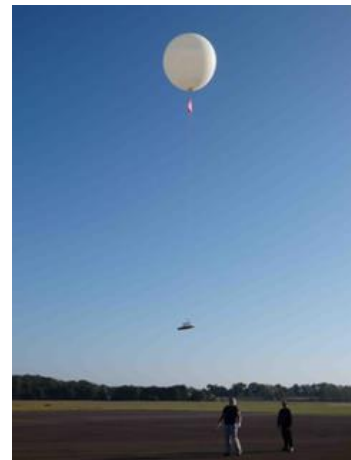
Fig. 2. Typical flight altitude and duration of a sounding balloon.